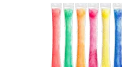
Freeze Pops for Shelf Storage 100% Juice Preferred