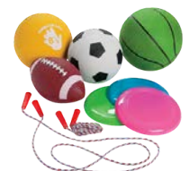
Outdoor Toys & Games