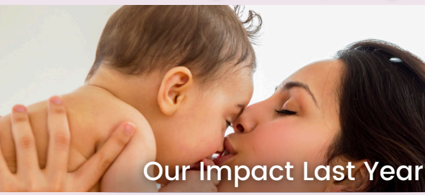
Our Impact Last Year