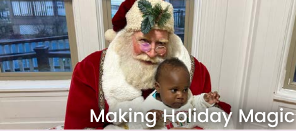
Making Holiday Magic