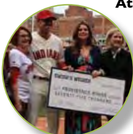
Swish's Wishes check presentation