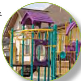
Leo's House playground

April was Child Abuse Prevention Month and a busy one for Providence House! We launched a new awareness campaign, hosted two of our signature annual events, participated in an international festival, and received a very special gift from one of Cleveland's newest Tribe members!