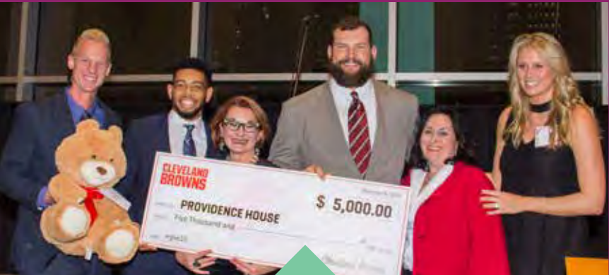
Deck the House December 11, 2018